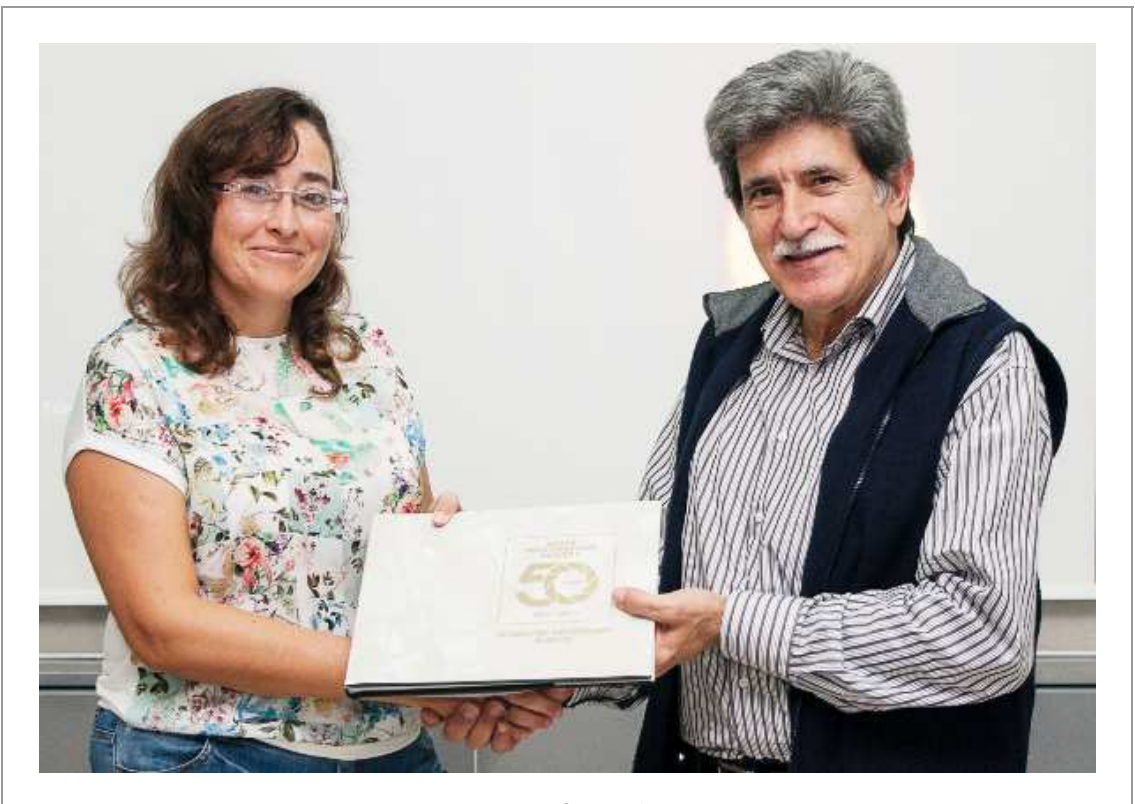
The park would like to thank The Malta Photographic Society for kindly inviting us to meet with their members to highlight the features of the park. We look forward to possible future collaboration and hope to