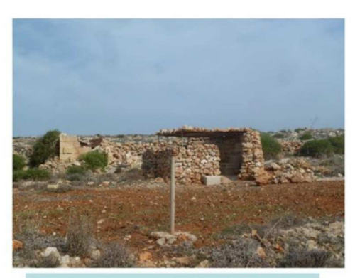
Trapping sites on public land within the park - The park sent its objection to the authorities about trapping sites that are set in sensitive ecological Natura 2000 areas or trapping sites that have been built on public land that are on unlet Government property. As a result 6 trapping sites had their permits revoked.