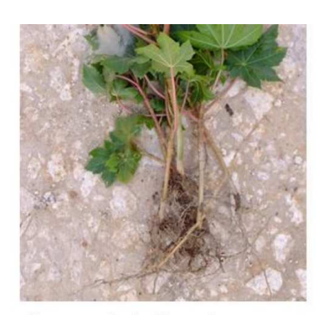
Removal of alien plants – During these last weeks the park has continued removing alien species, notably Agave and Castor Oil. Many Castor Oil were removed from nearby the visitor centre.